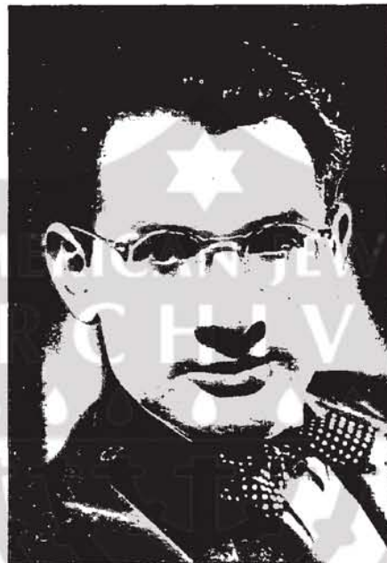
Rabbi Marc H. Tanenbaum

As announced in the February issue of The Northeaster , Rabbi Marc H. Tanenbaum assumed his new duties as our spiritual leader at his first Sabbath service on Friday evening, Feb. 6. The Chapel was crowded to capacity that evening and the attendance at subsequent services during the month has been most heartening.