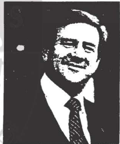
Dr. Jerry Falwell Moral Majority