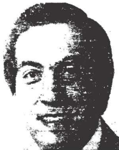
Rabbi Yechiel Eckstein