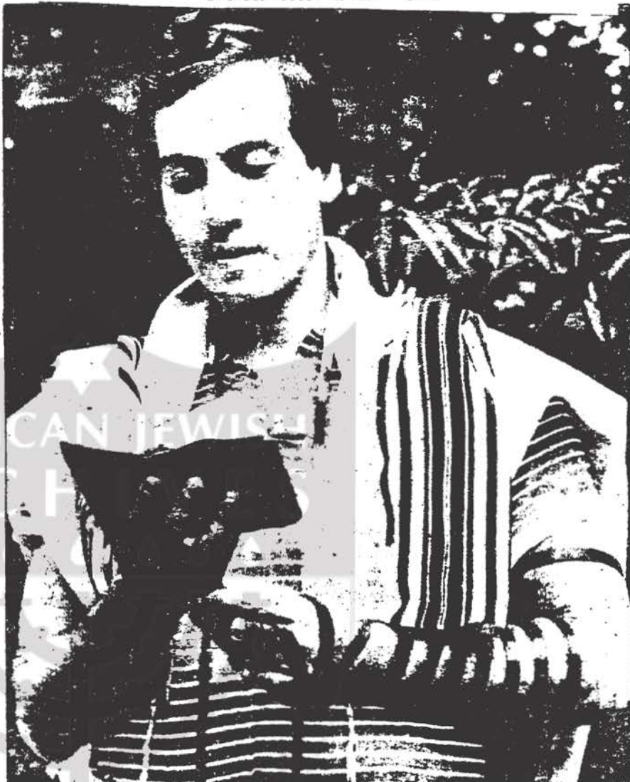
Each morning, the rabbi spends a few quiet moments with his prayers. The phylacteries are wrapped about the head and arms to symbolize how the scriptures should remain close to the mind and heart.

"At one point, I stopped in the marketplace near Jerusalem, and came out with a present for my kids. One of the Baptists traveling with us asked me how much it cost,