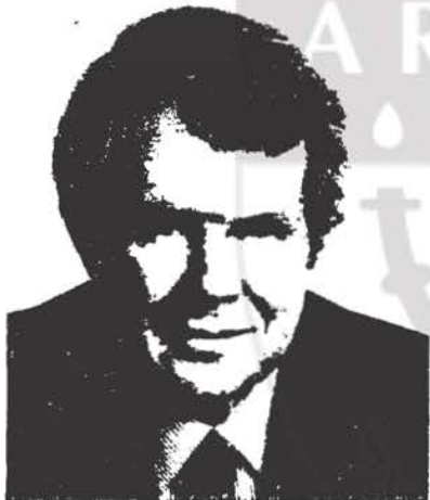
Dr. Pat Robertson Christian Broadcasting Network

Prepared under the direction of a panel of consulting editors: