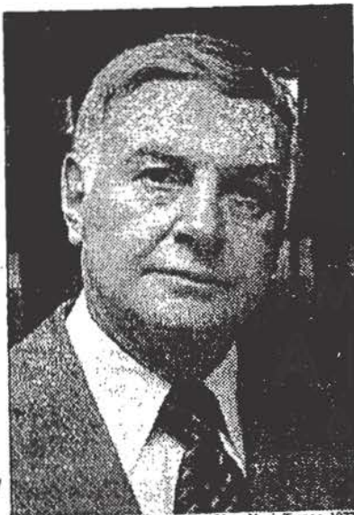
The New York Times, 1977