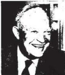
Dwight D. Eisenhower Founder, People to People International

“People want peace so badly that someday governments are going to have to get out of the way and let them have it.”