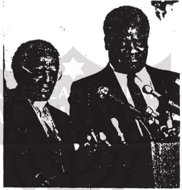
Bishop Desmond Tutu (left) and Mayor Harold Washington of Chicago.

ASKED SPECIFICALLY what Israel should be doing. Tutu acknowledged, "I am not worried about Israel's economic involvement with South Africa. That doesn't concern me so much because I don't think it is significant. It is their collaboration over military and security things . . . so that South Africa is able to carry out