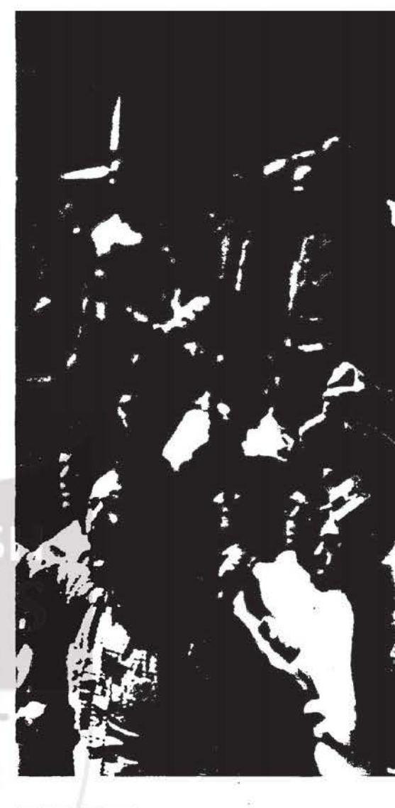
Demonstrators at an anti-apartheid rally at Yale. Across the United States, especially on campus and among Democrats, pressure against the South African Government's policies continues to build.

Nowadays, the Sullivan principles are also in the doghouse. Drafted almost a decade ago by the Rev. Leon Sullivan, a black Baptist minister from Philadelphia, the code calls for the desegregation of workplaces, equal employment practices, training for nonwhites, social services for black workers and the promotion of trade unionism. The code has been adopted by about 65 percent of the 260 or so American companies now doing business