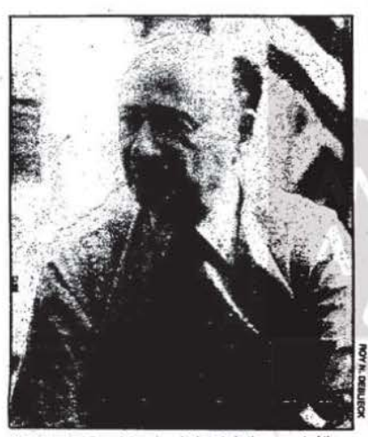
Mayor Koch: "One of the mitzvaha is to help the poore poor, and in this city, that happens to be those w