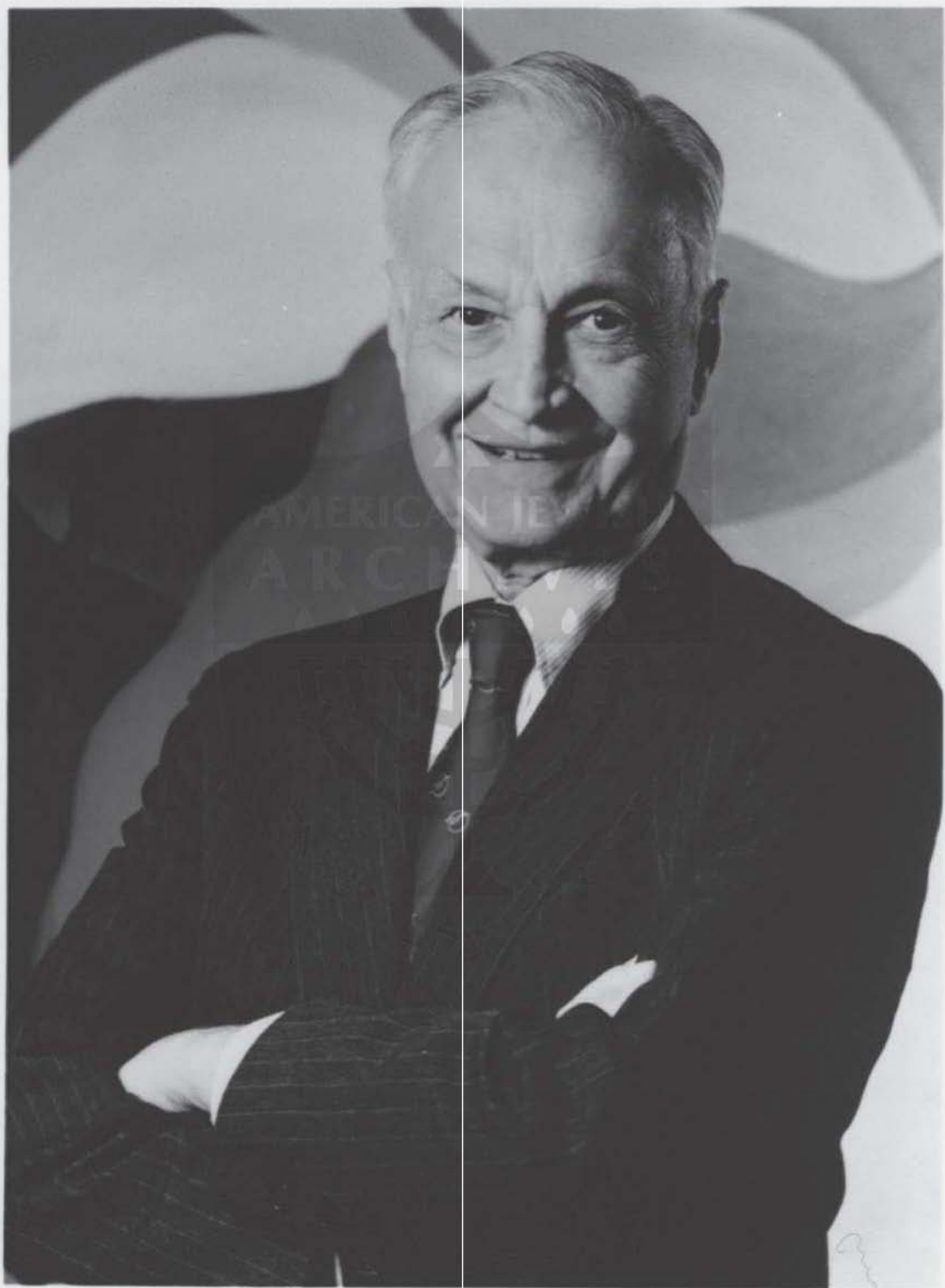
Sir John Templeton