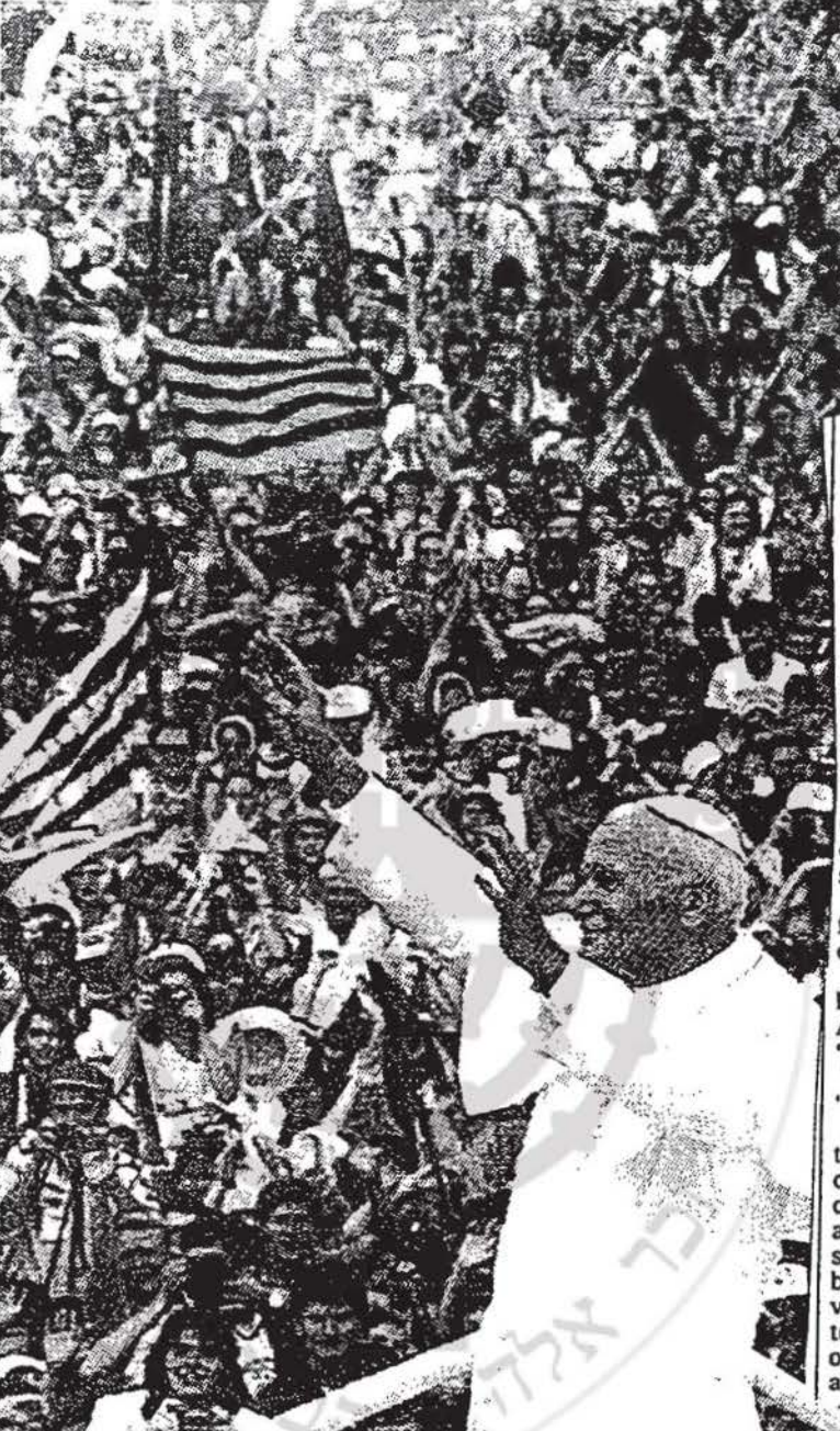
Pope John Paul II greeting a crowd of a million young people during a Vatican-sponsored World Youth Day in Czestochowa, Poland.

omeland this summer, comes as Catholic Church is facing a grow ecularism throughout the nation. his last visit in June, the Pope, w nelped to inspire the Solidarity moment that defeated Communism, 'uently invoked the call for a "I. vangelism" in Europe.