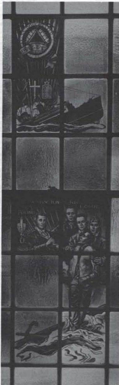
The Four Chaplains Window in the Post Chapel U. S. Military Academy West Point, N. Y.