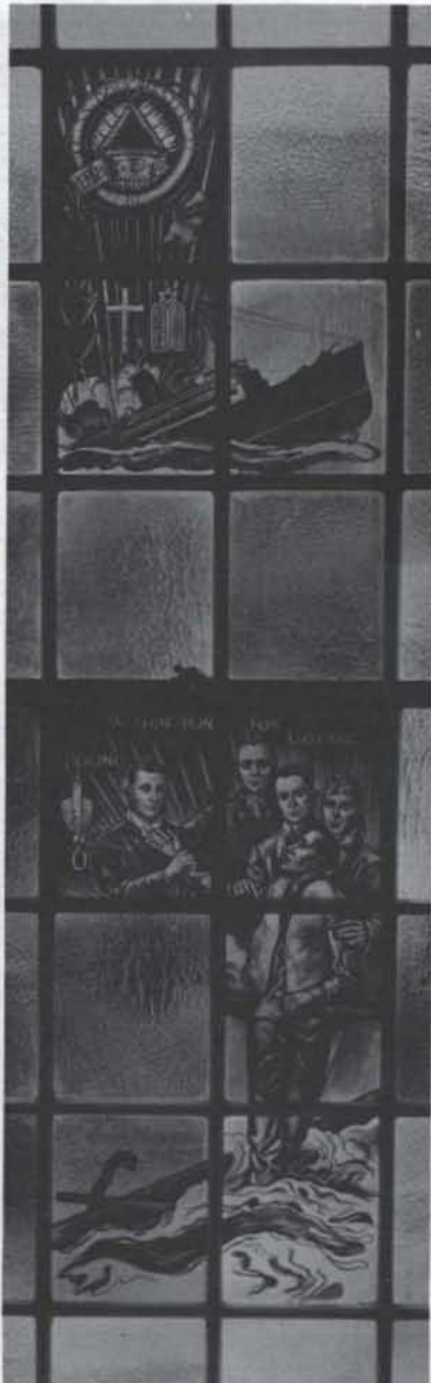
The Four Chaplains Window in the Post Chapel U. S. Military Academy West Point, N. Y.