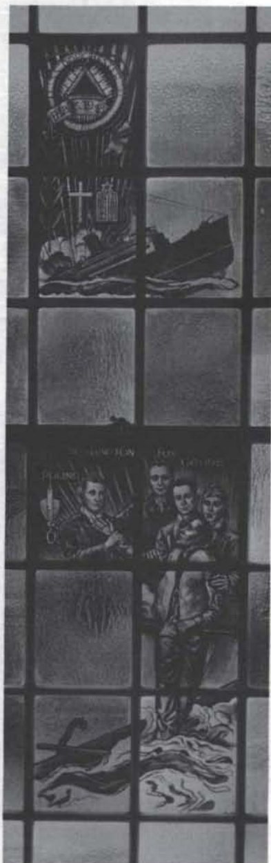
The Four Chaplains Window in the Post Chapel U. S. Military Academy West Point, N. Y.