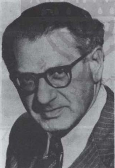
Rabbi Marc Tanenbaum