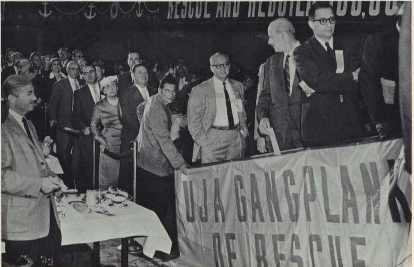
On Sunday morning, June 9th, representatives of more than 50 communities paraded up the UJA Gangplank of Rescue to present checks for $14,000,000 to swell the year's cash total to $44,865,000.

Moving ahead to the last half of the 1957 drive, the delegates adopted a resolution calling upon American Jewry "to match the superhuman effort of the people of Israel in helping to absorb the new flood of refugees." The resolution added that the UJA has "high hopes that the Jews of the United States will not relax in their efforts until every Jew uprooted from his home has been resettled in Israel or some other free land."