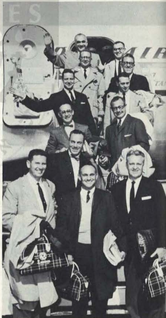
Members of the Boston Young Leadership Mission shown as they left for European and Israel study tour.