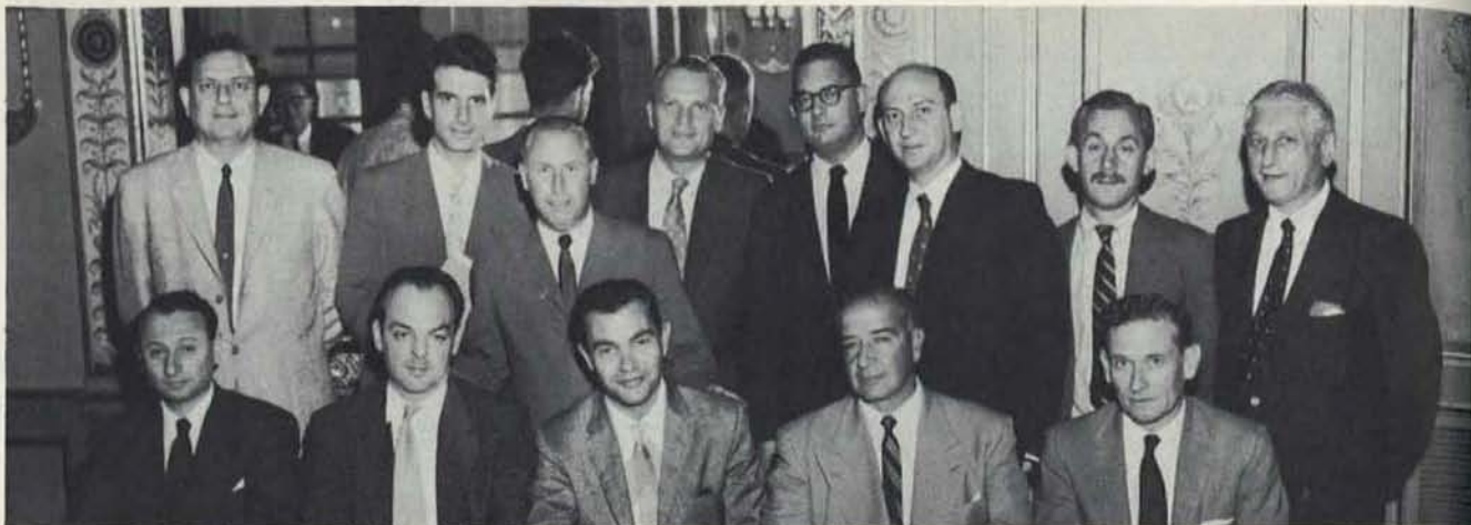
Some of the UJA leaders and Israeli participants in for discussions in New York before starting their