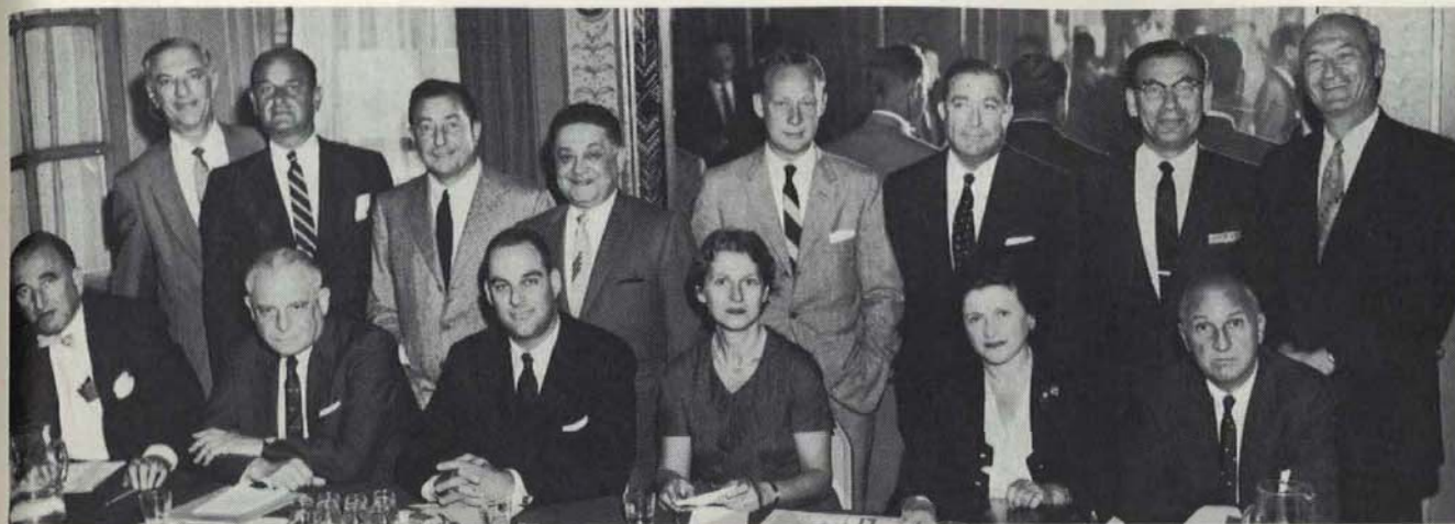
Second UJA Good Will Mission are shown meeting visits to communities throughout the United States.