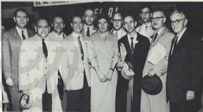
Members of the four-city Young Leadership Study Tour of Israel are joined by Renana Ben-Gurion, daughter of Israel's Prime Minister, who was a passenger on the same plane, for a departure picture.