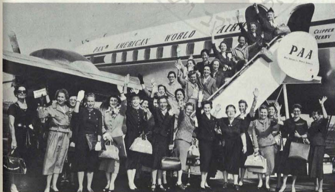
Members of the Third Survey Mission of the UJA Women's Division shown as they emplaned for Europe and Israel.