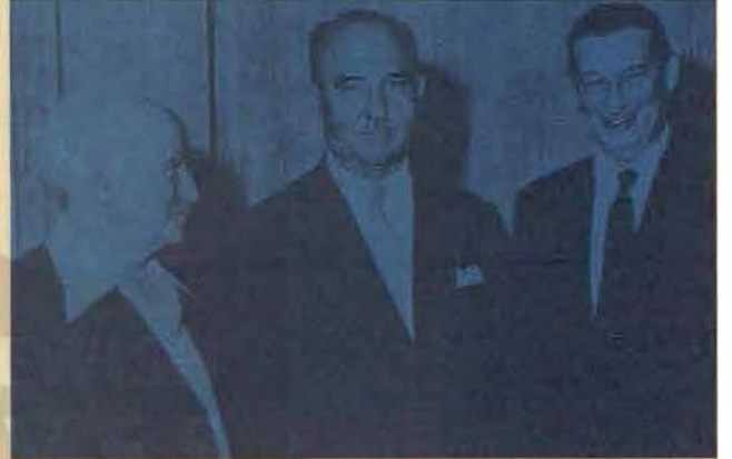
H. E. ZALMAN SHAZAR