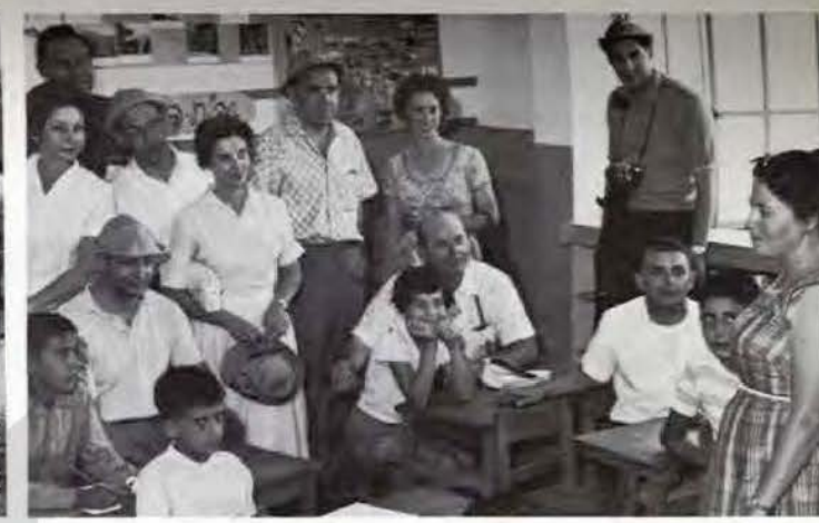
The school children of Lachish proved prime examples of the area's vigor and vitality. Thurs., June 8

On Thursday, June 8, our final visit of the day-after a morning at Lachish, and an after-