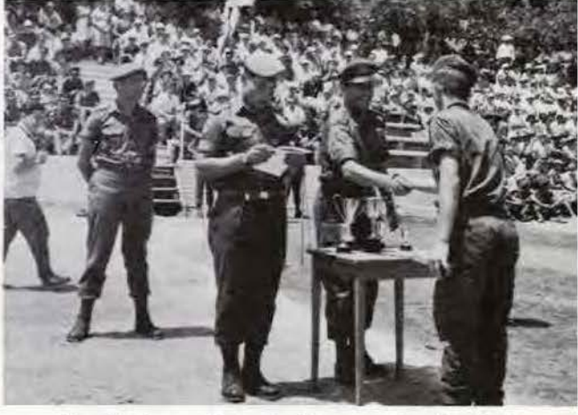
Equally impressive was dress parade of recruits at an army base on completion of basic training. Fri., June 9

We saw something of the small but highly effi-