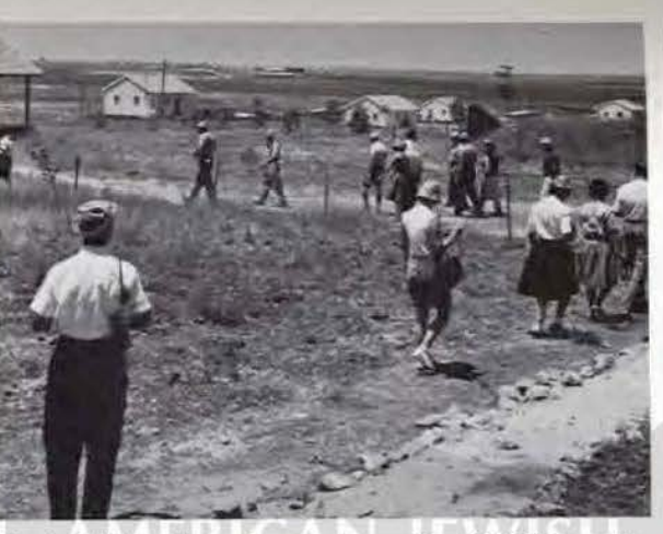
The Lachish settlement area, supporting 30,000 people, showed us UJA-aided absorption program at its best.

"Algeria, Cuba, Egypt, India, Iraq, Lebanon, Lybia, Morocco, Mexico, Persia, Poland, Ru-