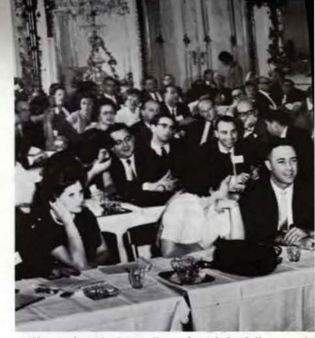
"Somewhere in Europe", we heard the full story of UJA aided programs in 26 lands outside of Israel.

In a three day stay in Europe, before going to Israel, we of the Mission received a view in extreme closeup of the status of Jews in various