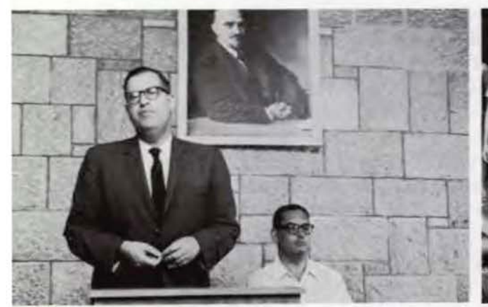
Discussion with Education Minister Abba Eban climaxed our visit to famed Weizmann Institute.

The Mission saw something of what Israel has already done in the way of making use of its water resources, when we viewed the drained and reclaimed Huleh valley from the heights of Mesudat Yesha. The Huleh reclamation not only put valuable land back into cultivation, it helped conserve the comparative abundance of water in Israel's north for use in the arid south. As we travelled through the country, too, we saw the