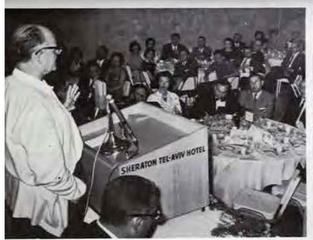
In Tel Aviv, Labor Minister Giora Josephthal outlined Israel's social progress and problems. Tues., June 6

The settlers of Lachish were busy harvesting sugar-beet, and a new sugar-beet factory was starting operation. Cotton, peanuts, vegetables, dairy and beef cattle are also grown in the region. Lachish is so planned that four or five farm villages are focused around a single administrative town. Each of these villages is inhabited by Jews from one given country or region—Morocco, Kurdistan, Egypt, India, and other lands too. The administrative town is the place where these groups mingle and get to know each other as they seek out the central educational, health, religious and social services which it holds.