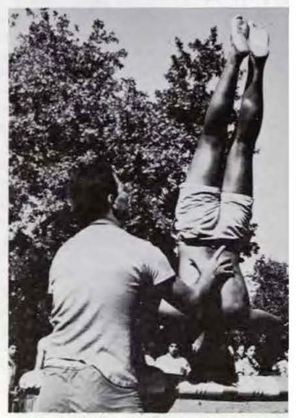
Youth Aliyah youngsters combine mental alertness with superb physical fitness.