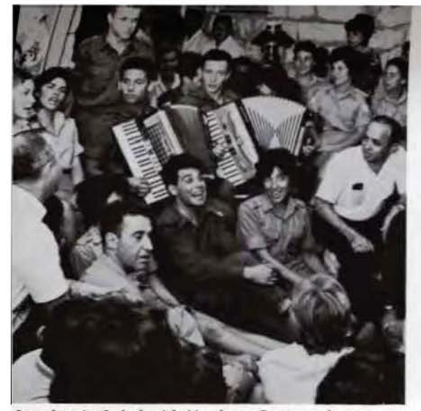
Songfest in Safed with Northern Command army group climaxed our first full day of touring. Sun., June 4