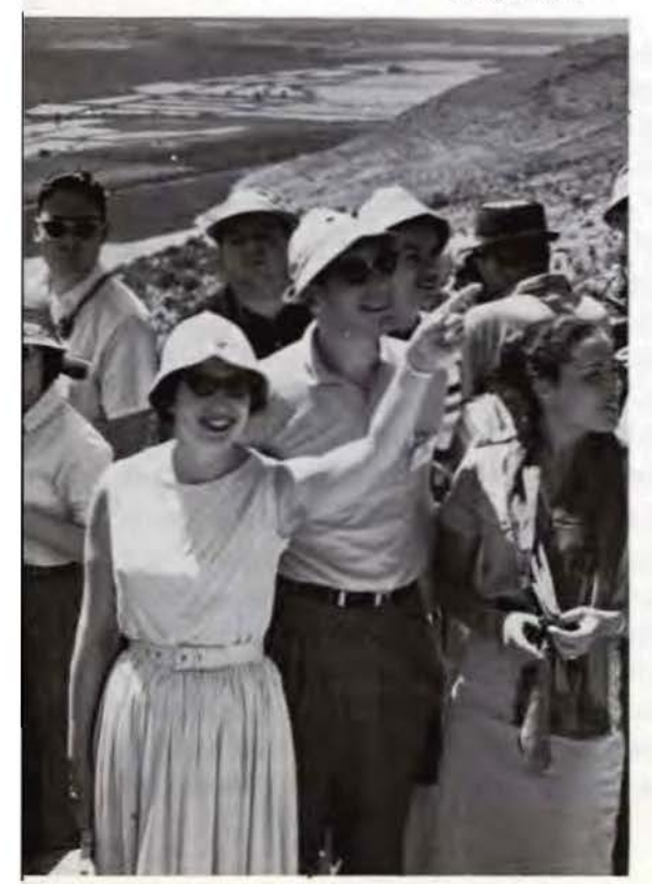
luleh Drainage project in Jordan Valley was an mpressive example of Israel land reclamation.