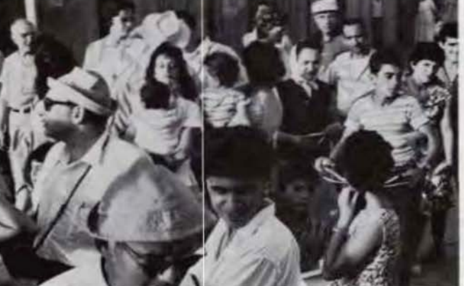
At Or Yehuda, we inspected this ma'abara soon to be replaced by a new housing project. Thurs., June 8

huge nine feet diameter pipes being set down.