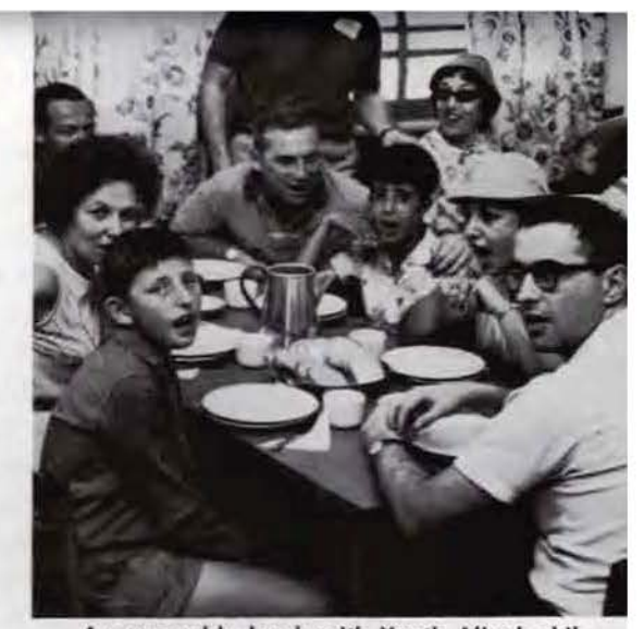
A memorable lunch with Youth Aliyah children at Ramat Hadassah Recreation Center. Sun:, June 4

Finally, the upsurge in immigration is threatening to greatly increase the numbers of newcomers in Israel who must turn to Malben—the JDC's special welfare program there for aged and handicapped immigrants.