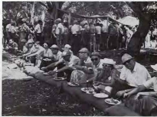
Time out for a picnic lunch at Founders' Grove, dedicated to the country's earliest settlers. Mon., June 5

The Mission began with a three day visit to Israel's north that included visits to institutions in the Haifa area, the mountain top towns of New Nazareth and Safed, the Huleh Valley region, a Nahal outpost on the Syrian border, and finally Haifa and its port.