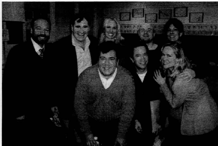
Richard Kind and Friends relax

HEBREW UNION COLLEGE JEWISH INSTITUTE OF REL 3101 CLIFTON AVE CINCINNATI OHIO 45220