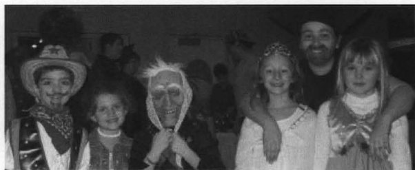
Kids of all ages had fun showing their Purim costumes.

Temple Israel celebrated Purim on March 13 with frivolity. The Sisterhood served an array of soups cooked by temple members. Then it was up to the sanctuary for a dramatic reading of the Megillah, singing Purim songs and marching through the aisles.