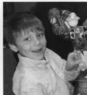
Check out the Haman/Zeresh dolls that we made!