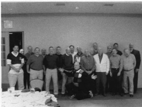
Brotherhood treated its many loyal ushers to a delicious brunch on October 15 to thank them for their loyal service.

We hope to include Canton Brotherhood whenever possible.