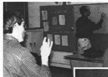
Small groups convened throughout the building to conduct mini meetings relating to the reflection process.