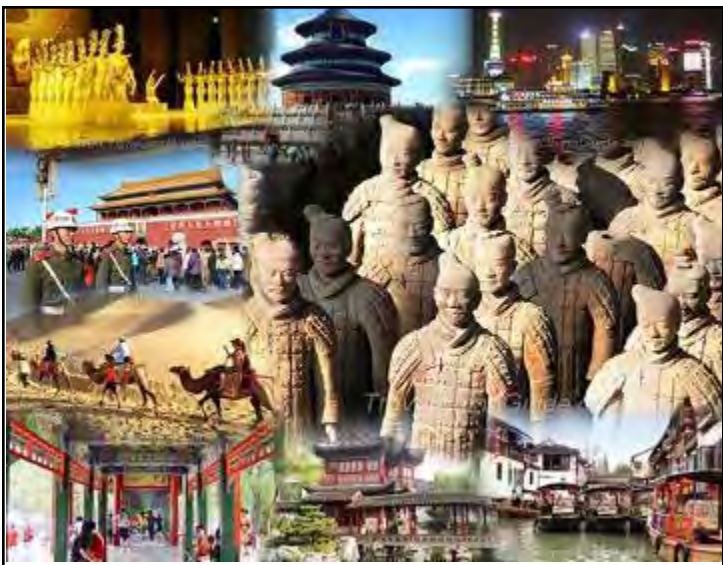
FOUR-CITY CHINA TOUR May 7 - 19, 2015 13 Days/12 nights

This conference is free and open to the public. One can attend all or any part of the conference. To view the full schedule and register for the conference, go to www.powellhellerconference.com. Contact Beth Kraig at (253) 535-7595 with any questions.