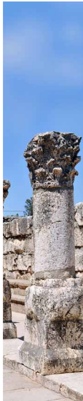
Holy Blossom Temple