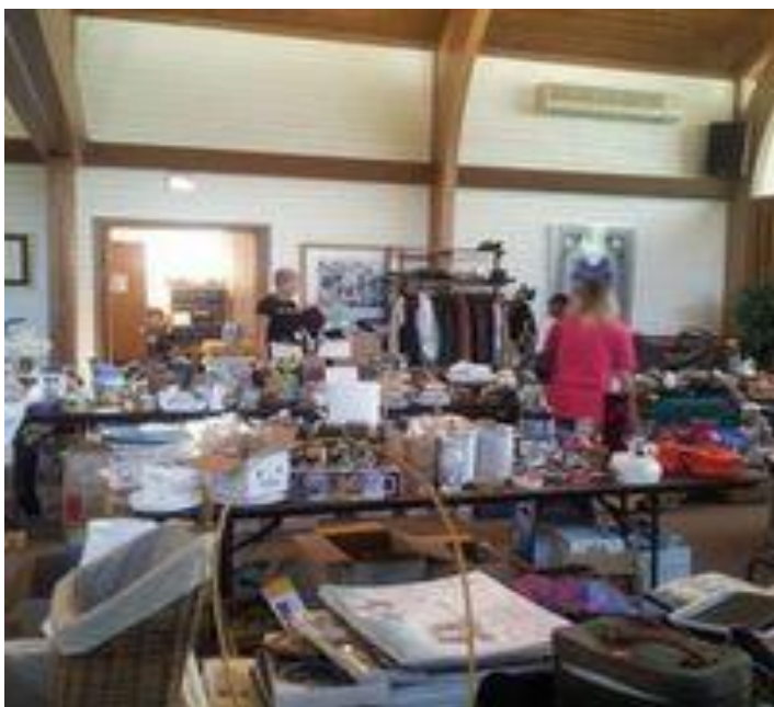
A peek at TEMV's summer yard sale