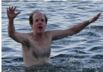
Chip takes the plunge