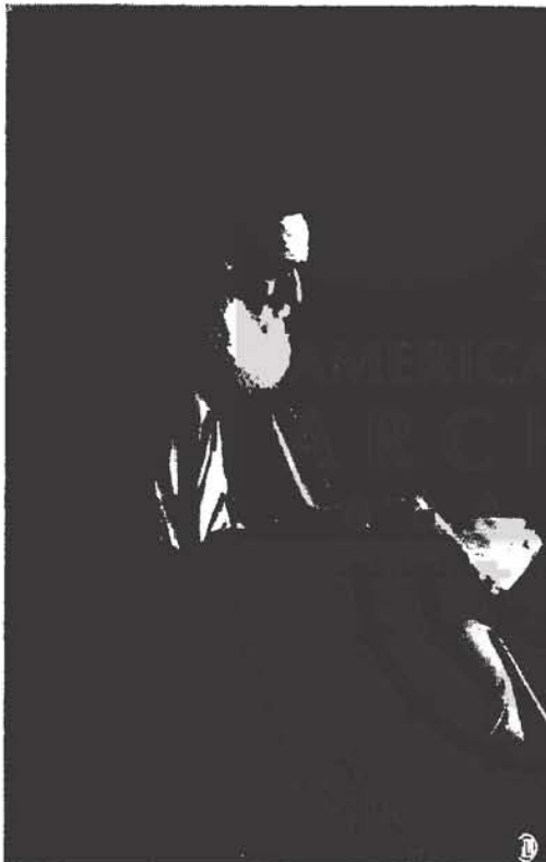
Jerusalem. Jew reading the Talmud.