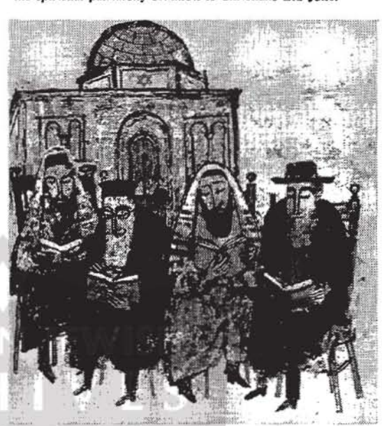
JEWISH BACKGROUND OF CHRISTIANITY DESCRIBED Text with illustration says: "Jesus worshiped in a Jewish synagogue"

"... Not a single negative reference to the Jewish people is to be found in these latest texts; on the contrary, a serious effort is made to portray Jews and Judaism in an affirmative light reflecting the Vatican Council's emphasis on 'the spiritual parimony common to Christians and Jews.'"