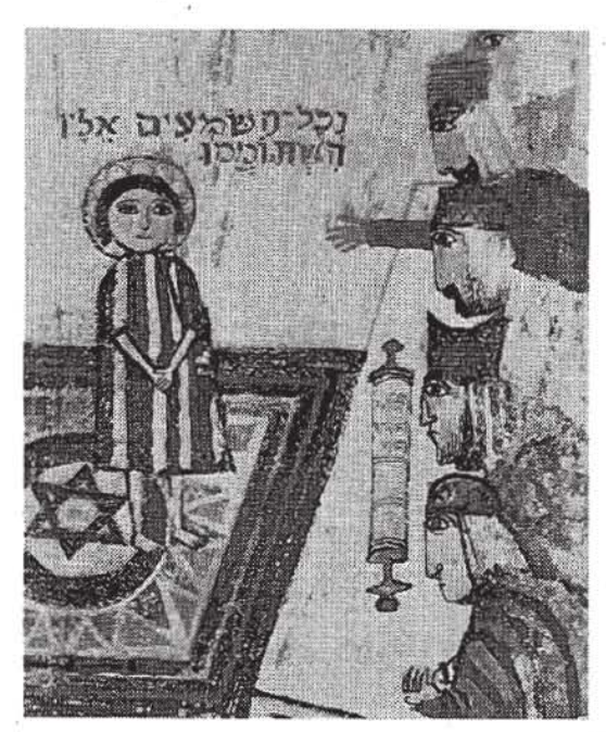
THE CHILD JESUS SPEAKING IN SYNAGOGUE "And all who heard him marveled"

took place in cooperative activity between church councils, rabbinical groups, and dlocesan representatives, as well as through interfaith groups of priests, nuns, ministers and rabbis in the areas of race relations, anti-poverty campaigns, and the pursuit of peace.