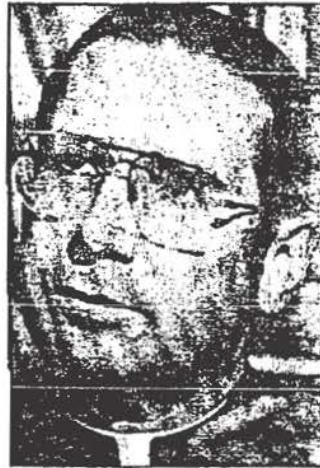
Roger M. Mahony