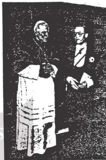
The Pope and Amb. Hallier

Convinced of the continuing fruitful and responsible collaboration between Church and State resulting in the continuation of the friendly diplomatic relations between the Federal Republic of Germany and the Holy See, I ask God's blessing and help for you and your embassy collaborators in your important task, and for your distinguished family as well.