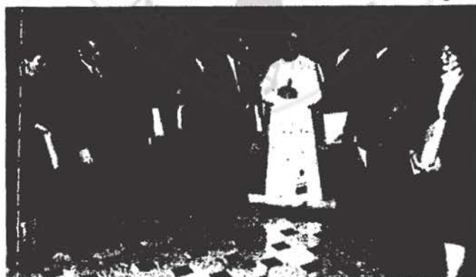
Pope John Paul II is pictured with leaders of the American Jewish Committee in Vatican City after the pontiff had given the group a private audience. The AJCommittee leaders urged the pontiff to establish diplomatic relations with the State of Israel as a means of bringing peace to the Middle East.