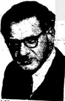
Rabbi Marc H. Tanenbaum

From all reports, the meeting between Pope John Paul II and Israel's Prime Minister Shimon Peres several weeks ago was a friendly one. When our American Jewish Committee delegation had an audience with the Pope several weeks ago Friday (Feb. 15) we discussed with the Pontiff his declared sympathetic attitudes toward Israel and Jerusalem, among other issues.