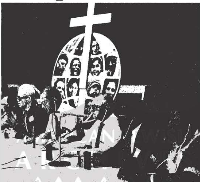
Southern Africa church leaders faced reporters during a news conference Wednesday noon.

"Therefore, the Assembly is constrained to