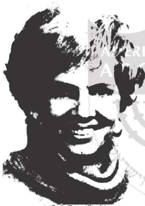
Ruth Carter Stapleton

Jewish community leaders on Long Island expressed dismay when it was learned last month that Mrs. Stapleton had accepted the invitation to speak at the Bnai Yeshua gathering.