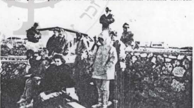
Students at Kibbutz Tuval Galilee Settlement Seminar, the Jewish Campus Leadership factfinding mission to Israel.