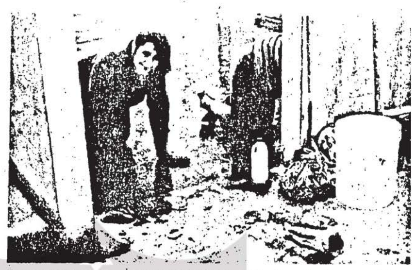
Durante el fin de semana pasado se trabajó en la terminación y limpieza del nuevo pabellón, con el que a partir de hoy cuenta La Samaritana.

Así las cosas, del 27 de noviembre al 4 de diciembre pasado, La Samaritana fue sede de una serie de operaciones por parte de los médicos extranjeros que trabajaron en coordinación con anestesitas colom-