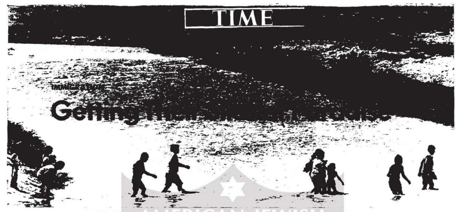
HOPING TO FIND A NEW LIFE, MEXICANS WADE ACROSS THE RIO GRANDE RIVER NEAR EL PASO, TEXAS, TO ENTER THE U.S. AS ILLEGAL ALIENS "No commandos or assault troops have shown more determination in storming a country that tries to keep them out."

The U.S. is being invaded so silently and surreptitiously that most Americans are not even aware of it. The invaders come by land, sea and air. They fly commercial and private aircraft; they jump ship or sail their own boats; they scale mountains and swim rivers. Some have crawled through a mile-long tunnel; others have squeezed through the San Antonio sewerage system. No commandos or assault troops have shown more ingenuity and determination in storming a country that tries to keep them out. They are the illegal immigrants who come not to destroy but to enjoy the blessings of the most prosperous nation on earth.