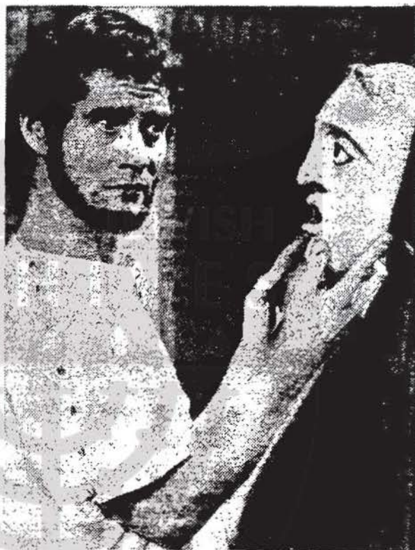
Anthony Andrews plays Nero, who dreams of being an actor, in the miniseries "A.D."

Stealing the show are two of Rome's most infamous Emperors. As