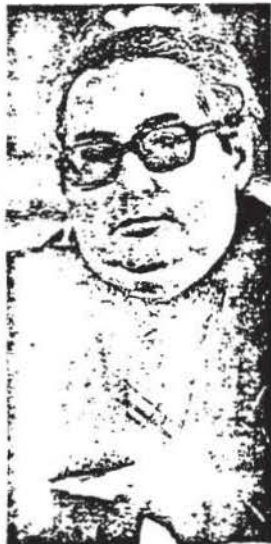
Serge Klarsfeld, who spent 12 years compiling book on Izieu.

"This morning, the Jewish children's home, 'children's colony,' at Izieu has been removed. 41 children in all, aged 3 to 13, have been captured. Beyond that, the arrest of all the Jewish personnel has taken place, namely 10 individuals, among them 5 women. It was not possible to secure any money or other valuables. Transportation to Drancy will take place on 4/7/44."