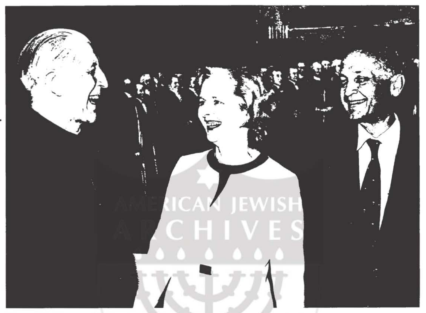
Margaret Thatcher, now British prime minister, shares a laugh with 1976 winner Cardinal Suenens and Templeton.