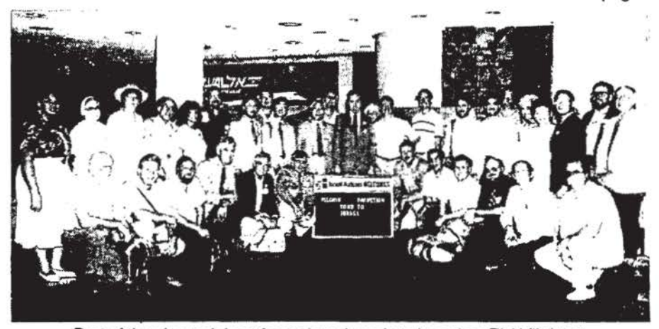
Part of the clergy delegation to Israel ready to board an El Al flight at Kennedy Airport in New York.

Our guide on a trip to Mauthausen, who spoke at length about his collection of materials and personal expertise on the Second World War, had never been to Mauthausen, only a scant two hours from his home. He had never studied the persecution of the Jews. He was — continued on page 2