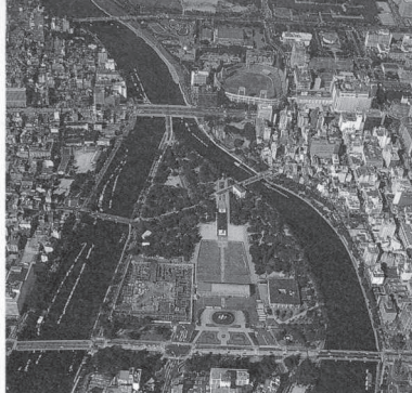
Peace Memorial Park