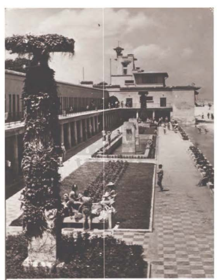
Vedere din Mamaia