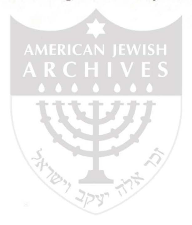
1961 Chronological Correspondence