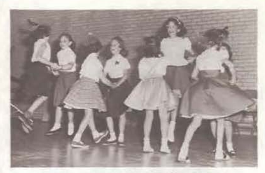
Our Denver and National Agencies Also Need Your Support

GIVE GENEROUSLY TO THE EMERGENCY IMMIGRATION FUND — OVER AND ABOVE 1962 REGULAR CAMPAIGN