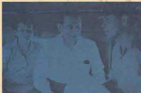
H. E. ZALMAN SHAZAR