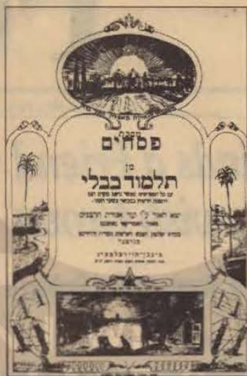
TALMUD'S TITLE PAGE

There's no chance of overlooking the origin of this edition. At the bottom of the title page is a grim illustration, framed by barbed wire, of two prisoners picking up a corpse in a death camp. It includes the sadly apt words from Psalm 119: "They all but obliterated me from the Earth, but I forsook not thy precepts." But the barbed wire leads up to palm trees and a por-