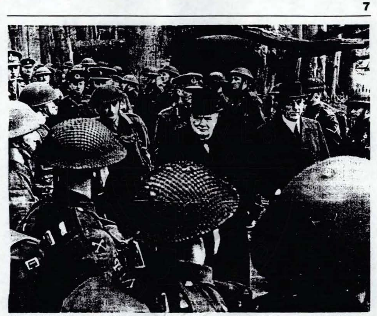
Prime minister Winston Churchill, accompanied by Turkish ambassador Rauf Orbay, inspects British troops.