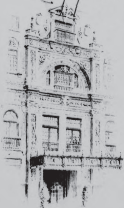
"Overlooking the Plaza"

HOTEL DE SOTO NEW ORLEANS LOUISIANA HOTEL PAXTON OMAHA NEBRASKA HOTEL CLOVIS CLOVIS NEW MEXICO HOTEL ALDRIDGE WICORA OKLAHOMA HOTEL WADE HAMPTON COLUMBIA SOUTH CAROLINA