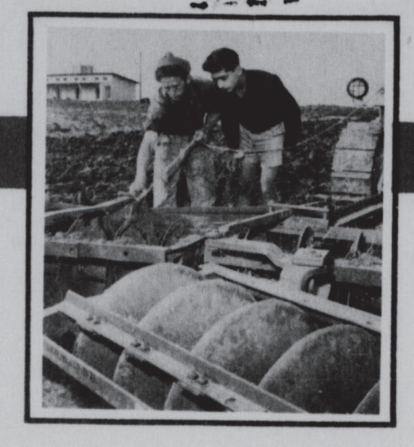
KFAR SILVER Agricultural Training Institute