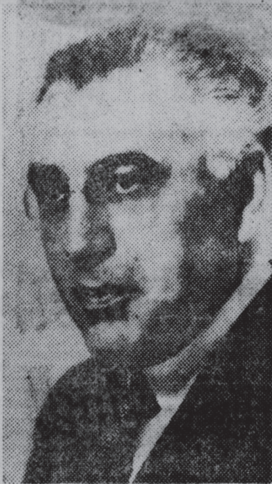
RABBI ABBA SILVER