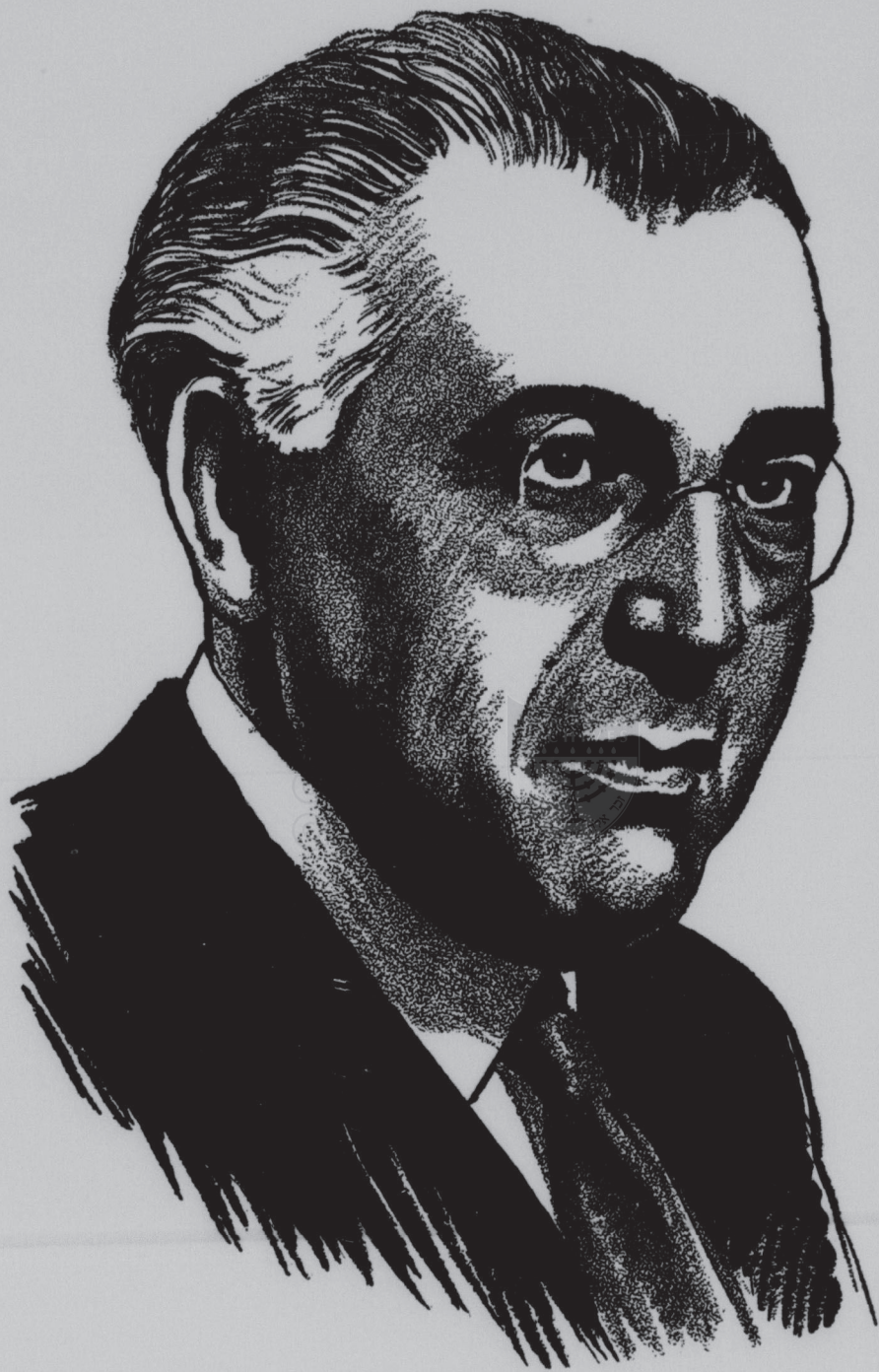
Dr. Abba Hillel Silver