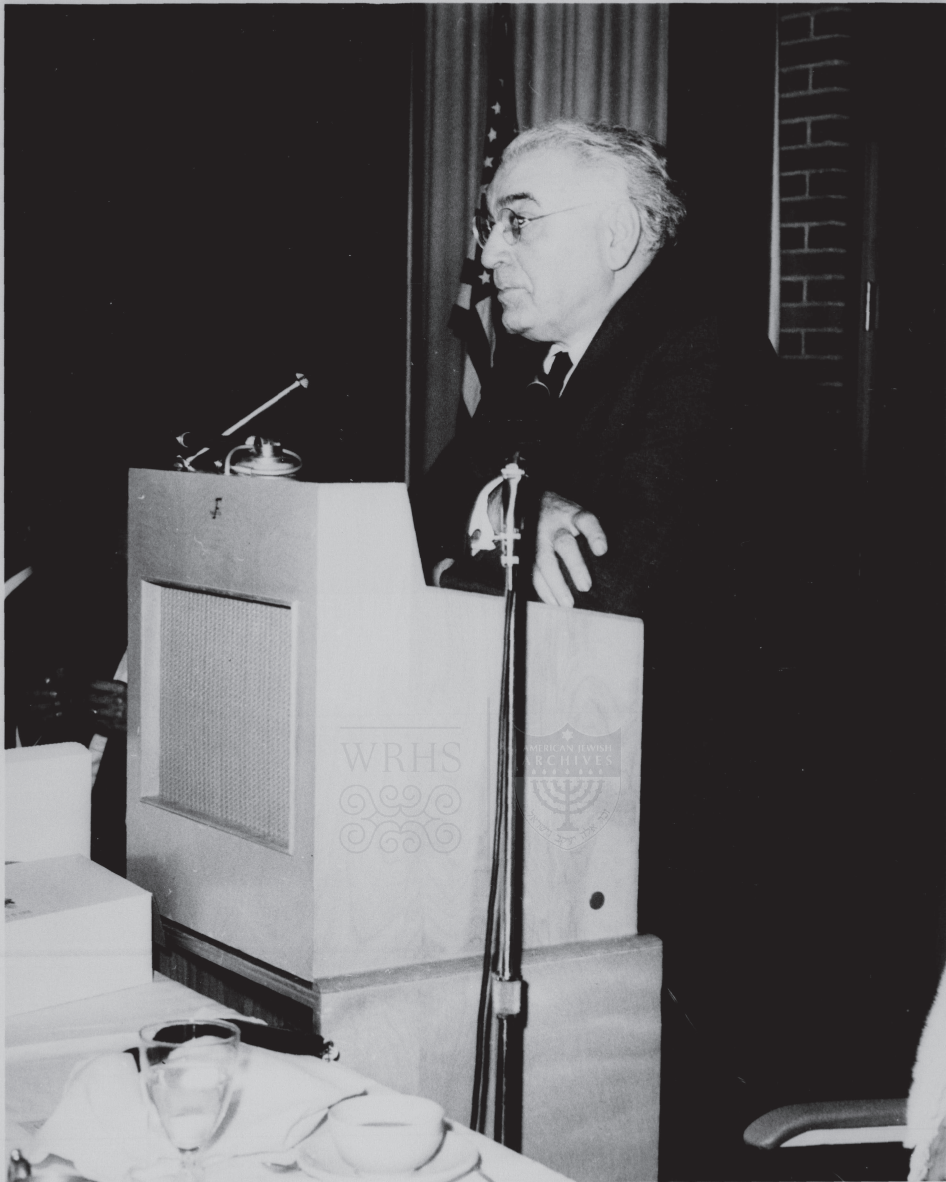
Dallas, Texas -- November 21, 1961