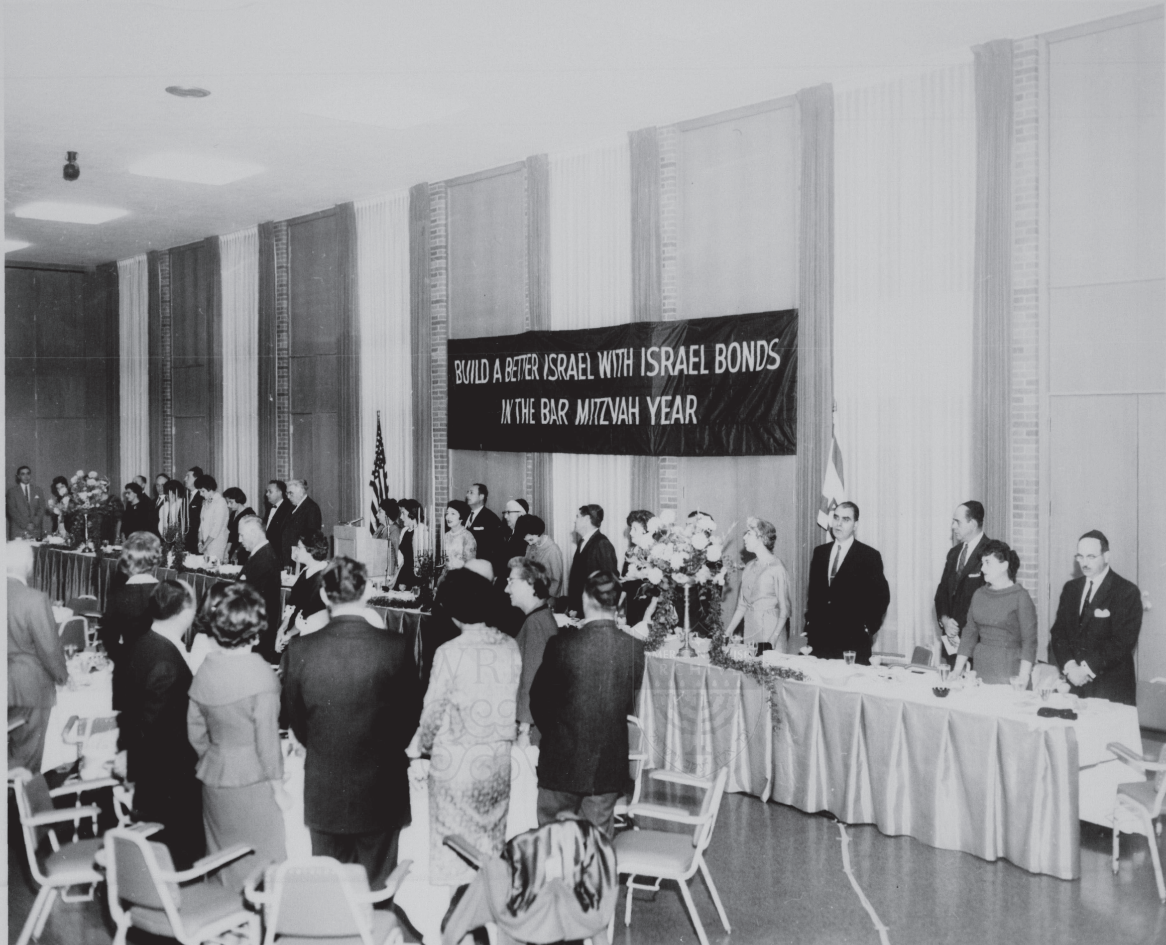
Dallas, Texas -- November 21, 1961