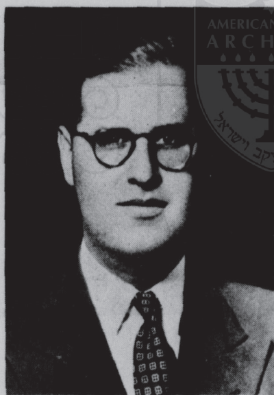
Ambassador Abba Eban

The dinner, sponsored by the Cleveland Chapter of Trustees, Sponsors and Guardians of Israel, will be the highlight of the 1956 Israel Bond campaign in Cleveland to provide investment capital for the economic development of Israel, and has aroused overwhelming support from all sections of the Jewish community.