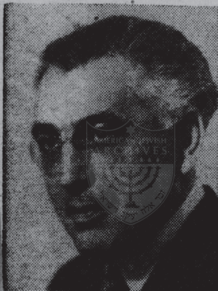
RABBI ABBA H. SILVER

The world-renowned American Zionist leader, Rabbi Abba Hillel Silver, has accepted an invitation