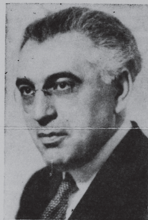
RABBI DR. ABBA HILLEL SILVER

A unique and now traditional phase of the State of Israel Bond programme in Montreal will once again be observed on Sunday, May 26th when more than 1000 volunteer canvassers will call on many thousands of Jewish homes in all sections of Montreal in a mobilization of economic support for the young democracy. The intensified one-day effort concentrating on the sale of Israel Bonds by personal contact, will make available additional economic resources intended to strengthen Israel during the present Middle Eastern crisis.