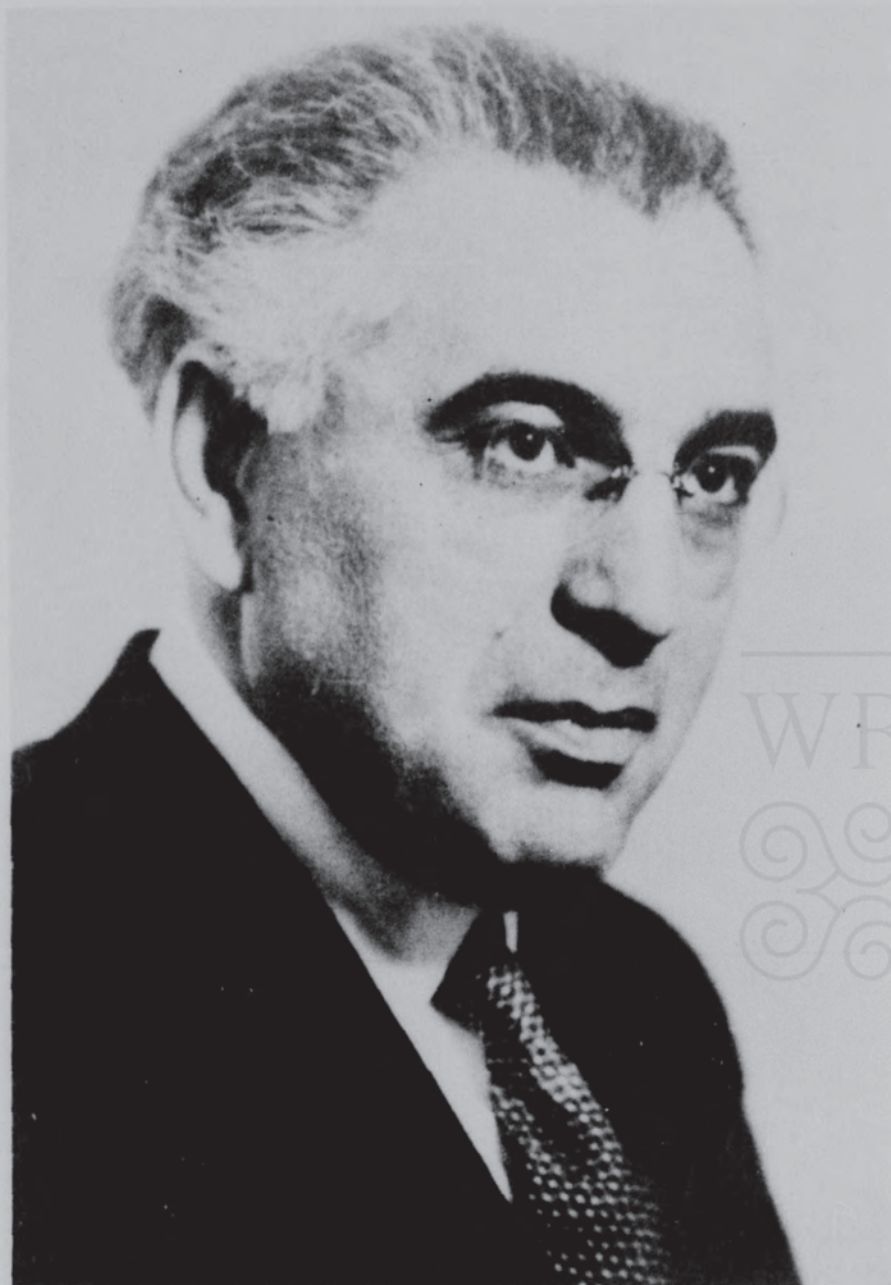
DR. ABBA HILLEL SILVER

AMERICAN JEWRY'S OUTSTANDING PERSONALITY