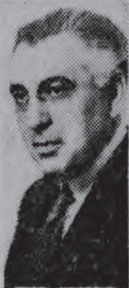
DR. ABBA HILLEL SILVER

Dr. Abba Hillel Silver, chairman of the board of governors of the Israel Bond Organization and a foremost American Jewish spiritual leader, will appear at a banquet in Norway Center, starting at 6:30 p. m. Tuesday on behalf of State of Israel development bond issue.