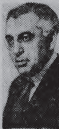
ABBA H. SILVER

Silver heads the planning body for the State of Israel Development Bond Drive throughout the United States, Canada, Latin America and Western European countries.