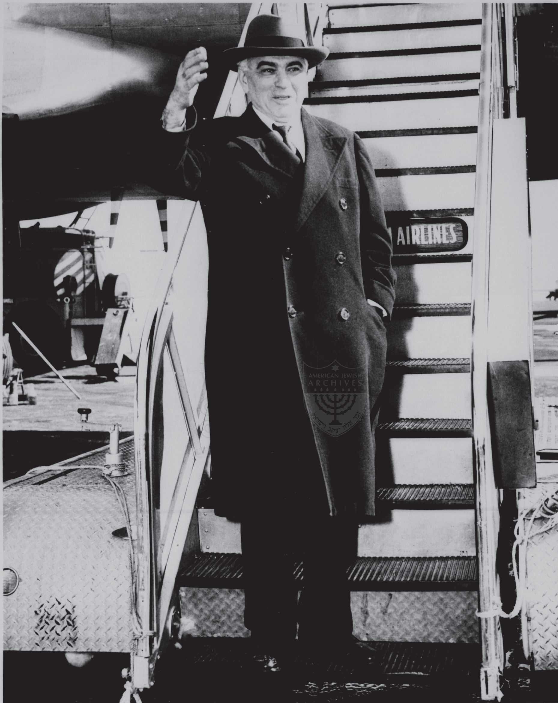
March 20, 1956 - Departure for Israel