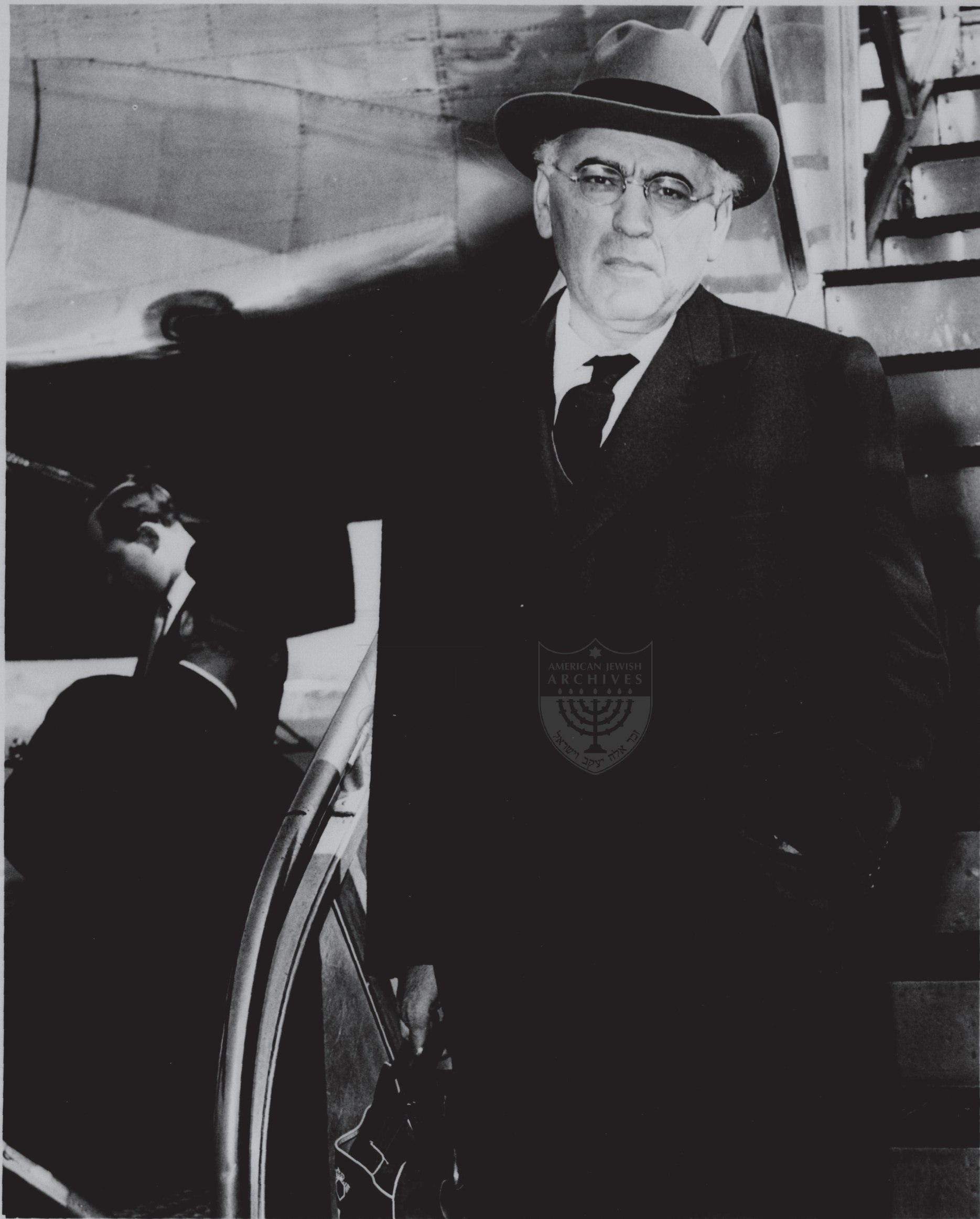
April 6, 1956 - Return from Israel