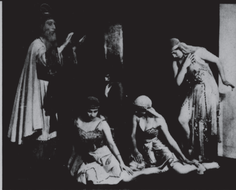
THE HIGH PRIEST BLESSES THE DAUGHTERS OF ZION