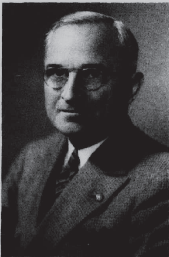
President Truman, who "will go down in history as one of those responsible for righting a historic wrong done to Israel."

At that very time, President Truman was working the hardest to insure a favorable vote. The failure of the Ad Hoc Palestine Committee to command the two-thirds majority made it clear to him that the persuasive power of the U.S. delegates was essential if that vote was to be achieved in the General Assembly. He took this matter seriously to heart; he made it unmistakably clear to the American delegation